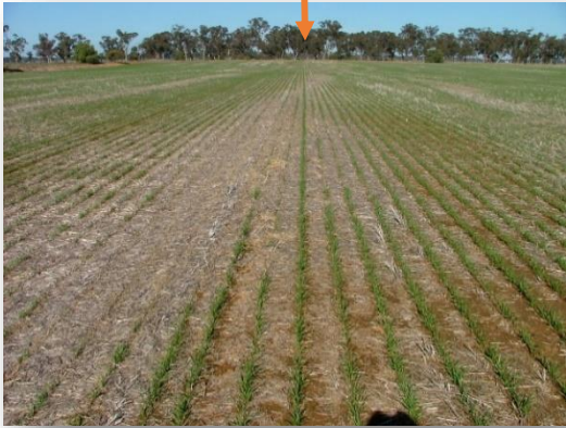
One Aricks wheel in use