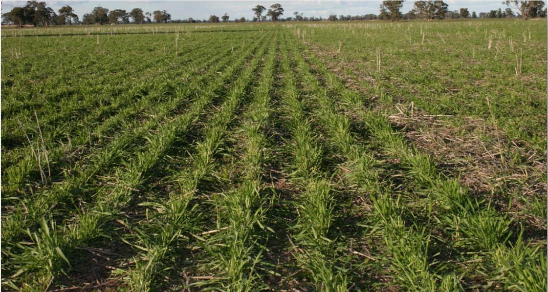
No Aricks Wheels