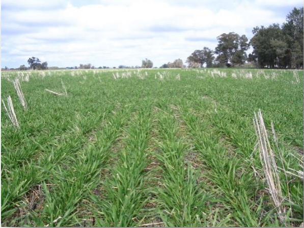
Full set of Aricks wheels in use